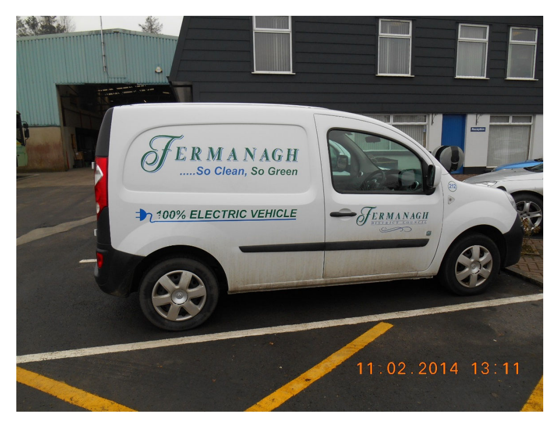
Figure 3 - Fermanagh E-Van