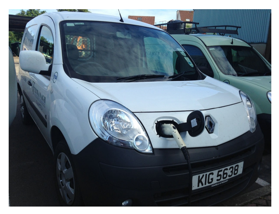
Figure 2 - E van charging onsite, Enniskillen