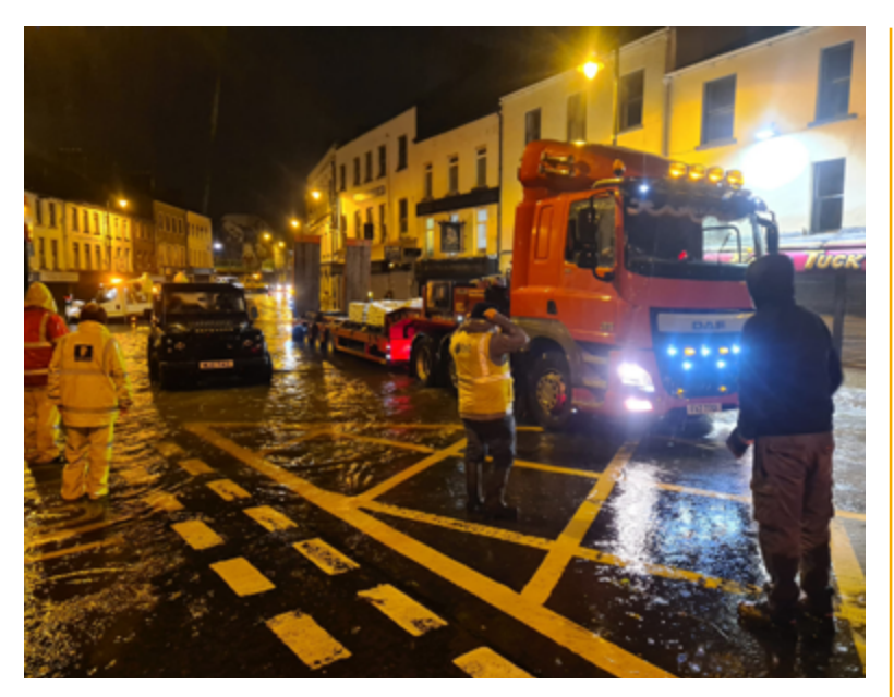
Above & below: Recent flooding in Newry