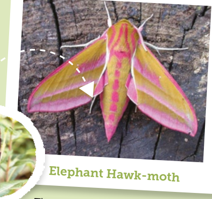
This is one of our most beautiful and recognisable moths with its pink and green colouring. Its caterpillar feeds mostly on Rosebay Willowherb and Fuchsia and it is the caterpillar that gives it its name, due to its resemblance to an elephant's trunk.