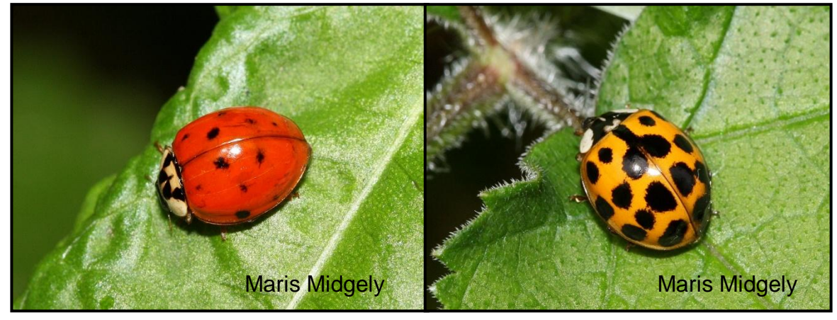
H. axyridis f. succinea