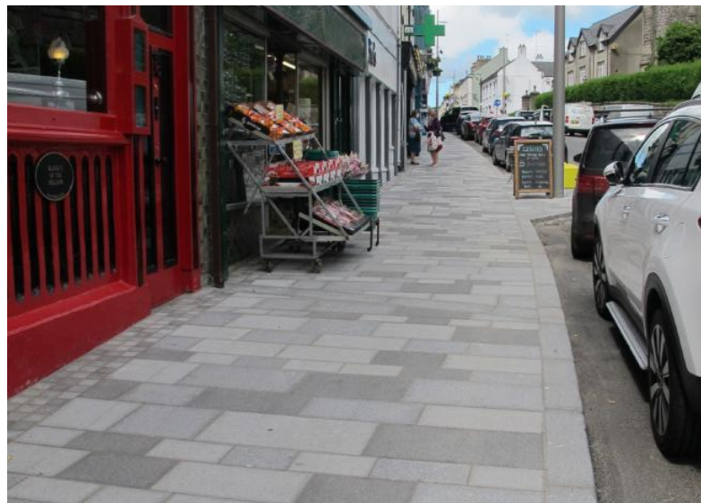
Church Street looking towards St Macartin's Cathedral