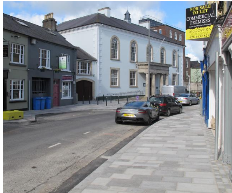
East Bridge Street