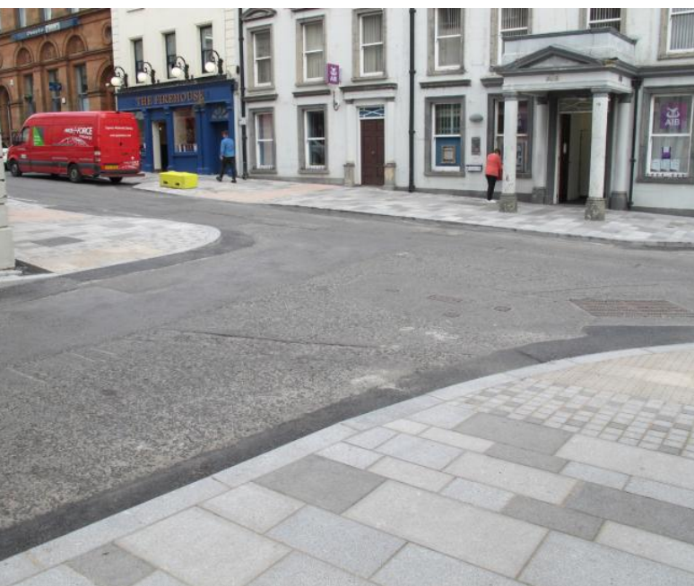
East Bridge Street, High Street and Regal Place junction