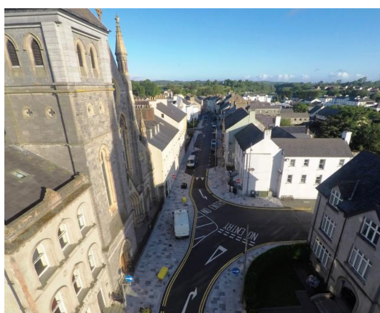
Church Street looking towards Darling Street and Hall Street Junction