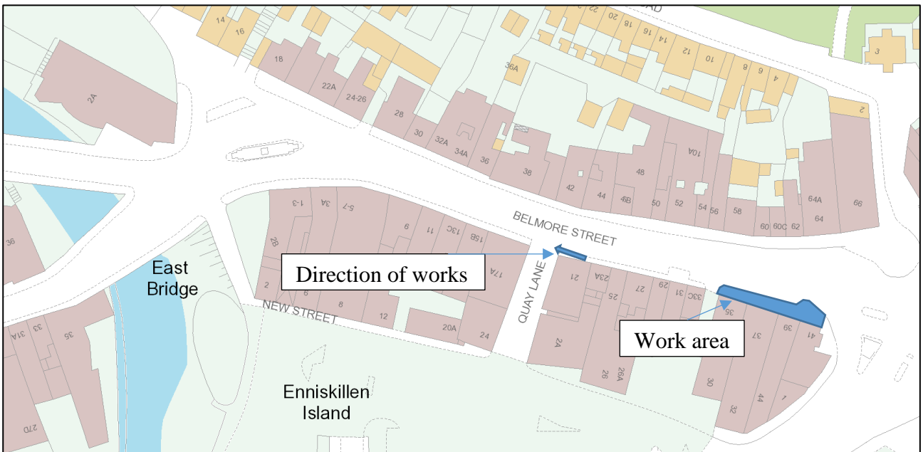
Squad 2 - Belmore Street